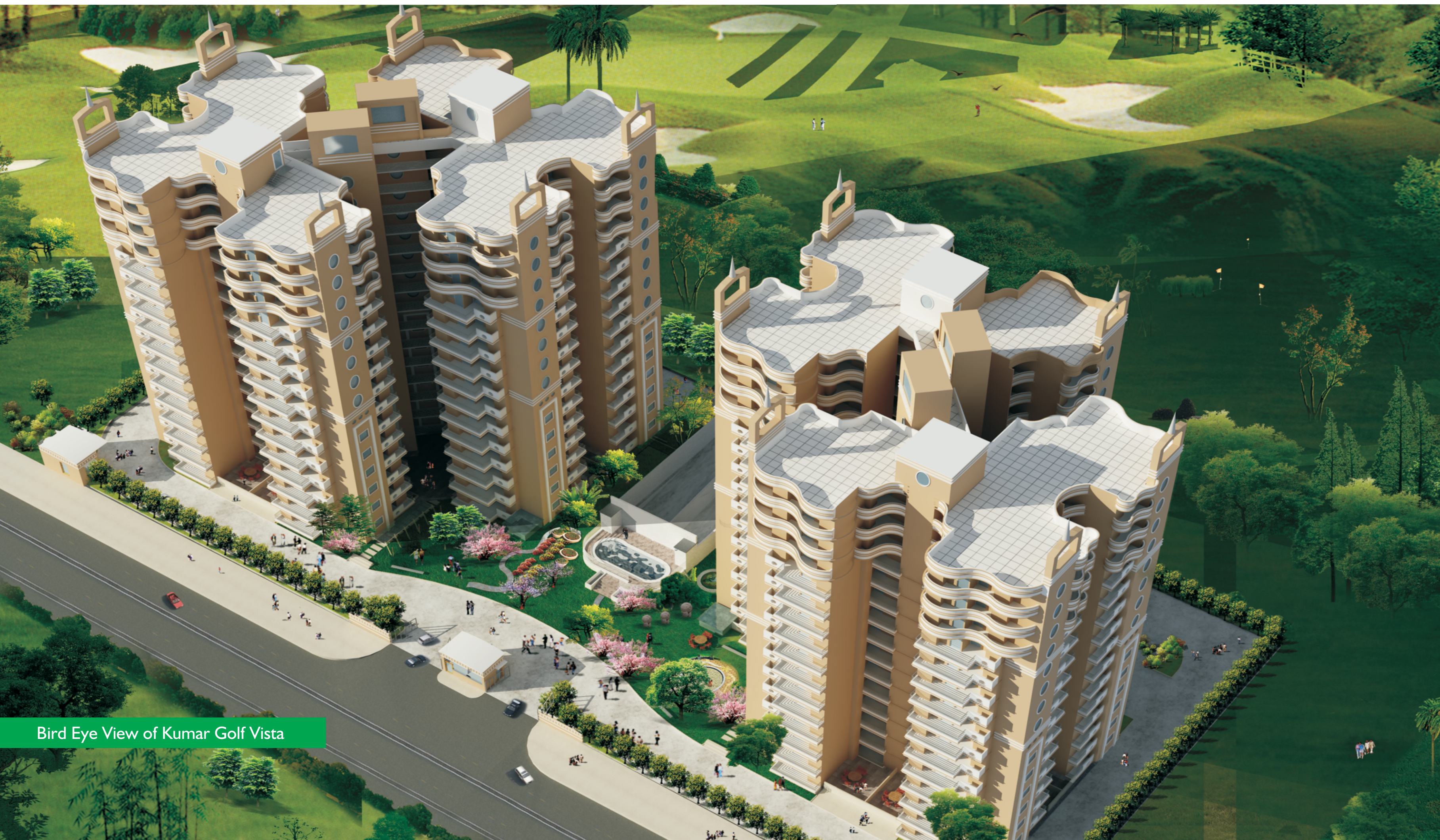
Bird Eye View of Kumar Golf Vista