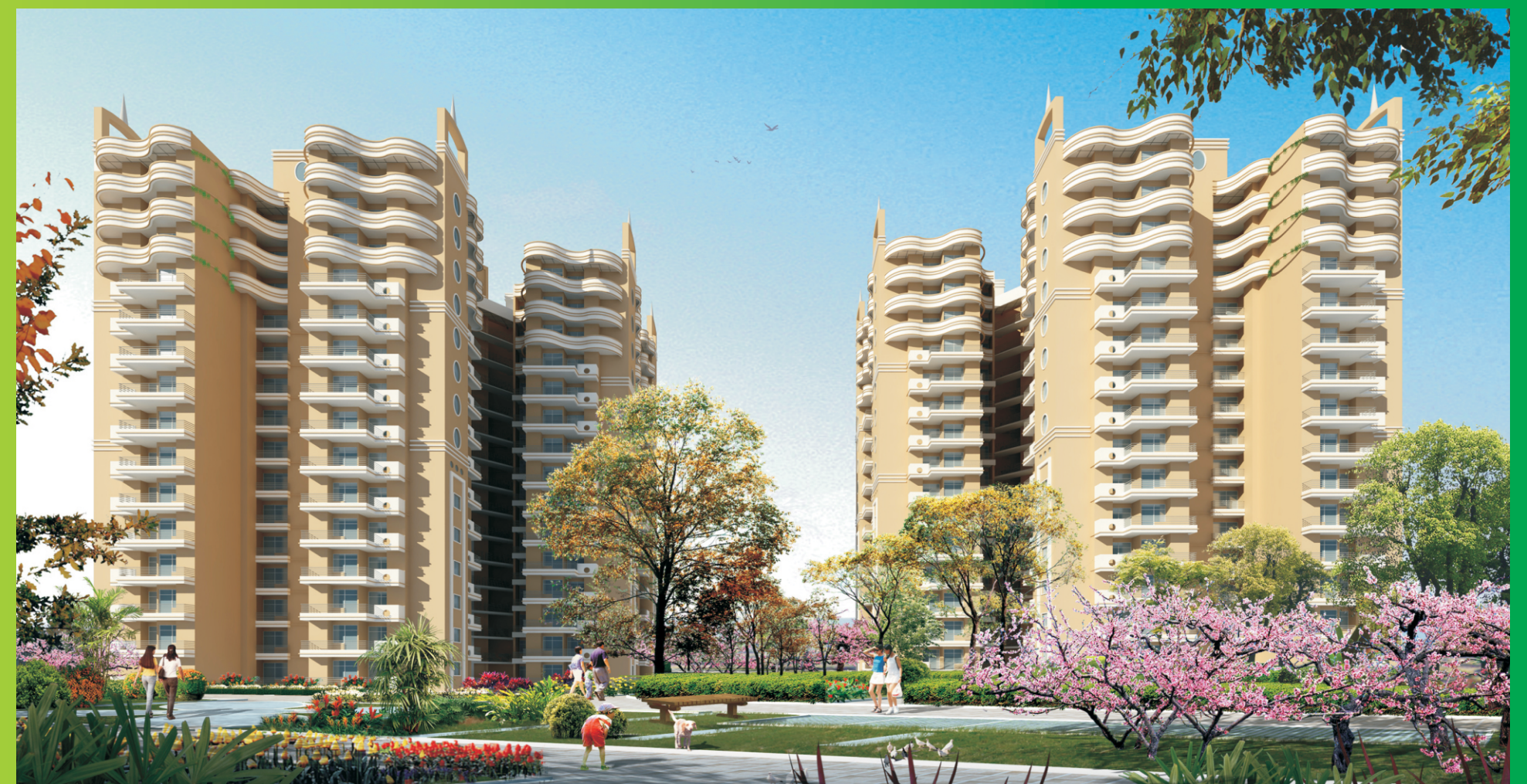
Picturesque Front View of Kumar Golf Vista: The best elevation in the locality