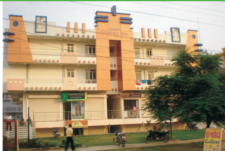
KUMAR EXCELLENCY PLAZA A new world of happiness Plot No. 8, Sector 11, Vasundhra