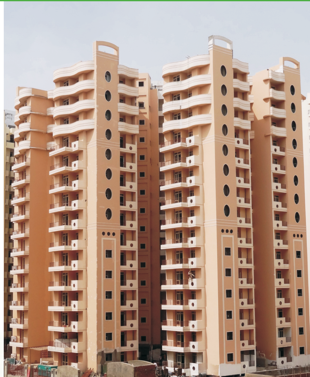
GOLF GREENS CROSSING REPUBLIK, NH-24, GHAZIABAD 3BHK PREMIUM HOMES

Actual site photographs of projects completed by us : Reflecting the commitment