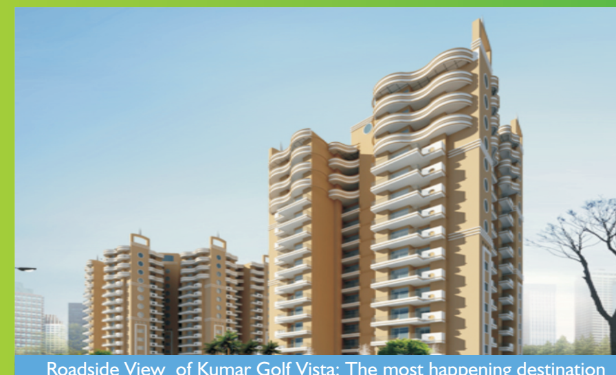
Roadside View of Kumar Golf Vista: The most happening destination