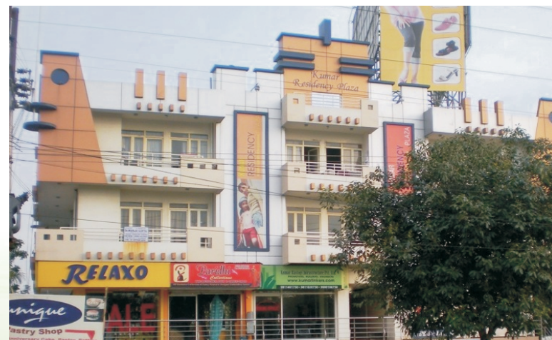
KUMAR RESIDENCY PLAZA A new world of happiness Plot No. 1, Sector 11, Vasundhra