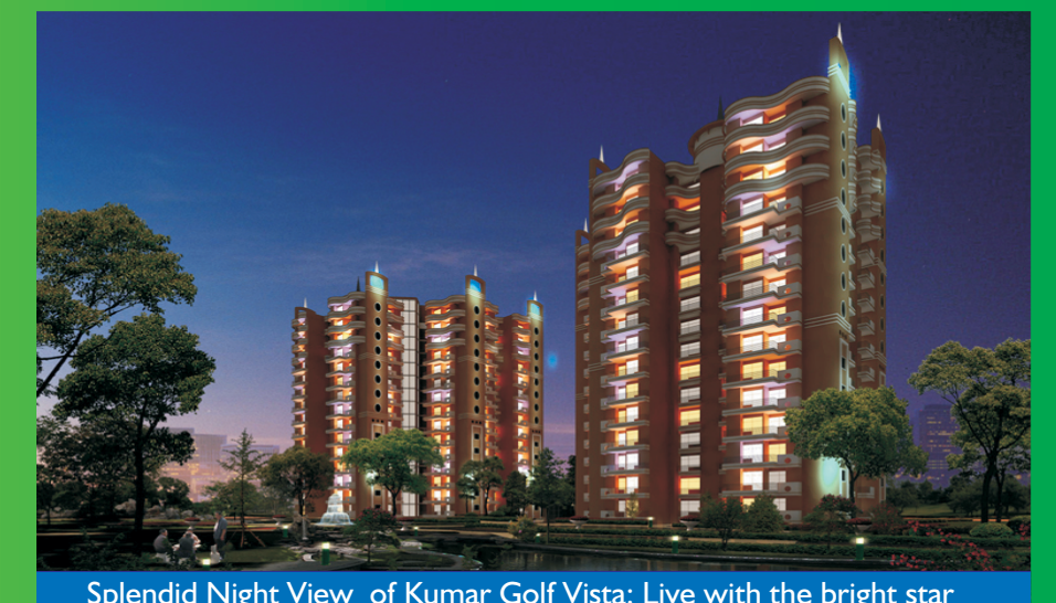
Splendid Night View of Kumar Golf Vista: Live with the bright star